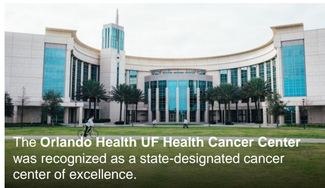
The Orlando Health UF Health Cancer Center was recognized as a state-designated cancer center of excellence.