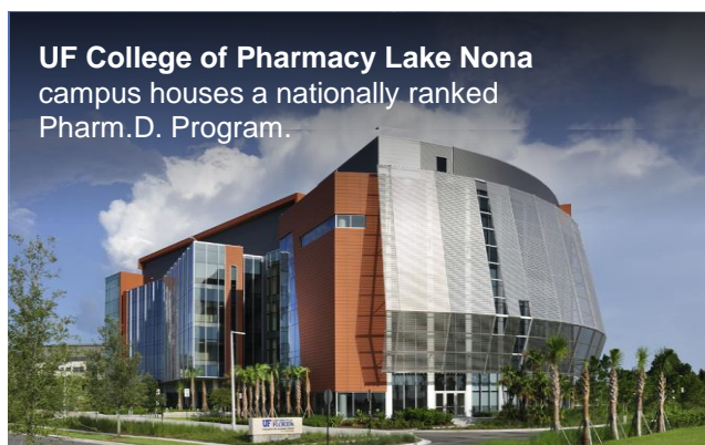
UF College of Pharmacy Lake Nona campus houses a nationally ranked Pharm.D. Program.